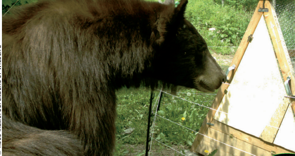
A black bear is about to find out that this chicken coop is protected by a newly installed electric fence.