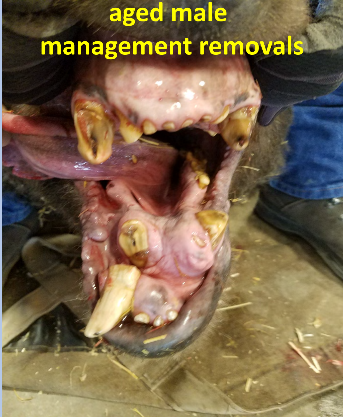
aged male management removals