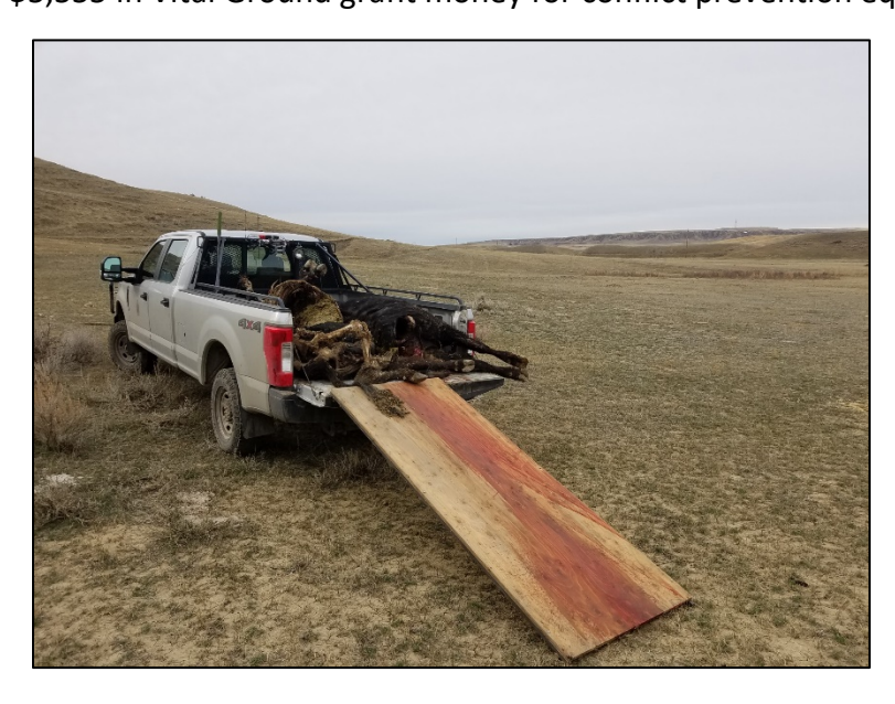
Figure 2: Removing a bone pile that was attracting a grizzly bear near residences and livestock. The carcass driver came on late in 2019 and thus we had to fulfill the need.