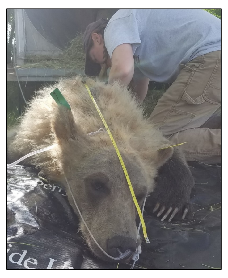
Figure 5: This subadult female was preemptively captured north of Conrad because she was frequenting areas close to residences, but not obtaining human food. She stayed away from people after the relocation to Blackleaf WMA.

Obtained approval and funding to initiate a research project testing if livestock guard dogs can keep grizzly bears out of commercial corn fields.