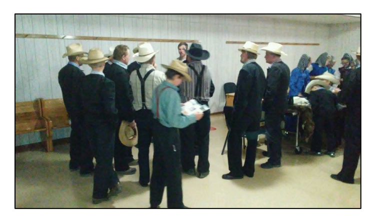
Figure 1: Grizzly bear outreach and education at Cascade Hutterite Colony.

Montana Fish, Wildlife, & Parks-Region 4 hired a new Bear Management Specialist and a Bear Technician to cover areas where grizzlies are expanding. These positions are based in Conrad and began at the end of July 2017. Below is a summary of efforts for the second full calendar year of this position (December 2018 through November 2019). Grizzly bears remain listed under the Endangered Species Act, despite being biologically recovered. Thus, final grizzly bear management decisions are under the authority of the United States Fish and Wildlife Service.