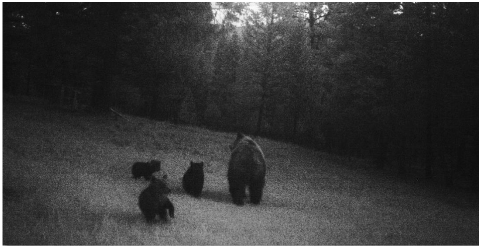
Figure 5. Female grizzly bear with 3 cubs-of-the-year at a residence in the Eureka area

Traps were used at 35 locations, over 141 trap nights, to help resolve a human-bear conflict. Traps were used cooperatively at 19 locations with other management tools (i.e. electrified fencing, Critter Gitter®, etc.). Of the 3 black bears that were captured, 1 was captured in the Fortine area and relocated, 1 was captured in the Noxon area and relocated, and 1 was captured in the Thompson Falls area and humanely euthanized due to being habituated to people and conditioned to human foods. Of the 5 grizzly bears that were captured, 2 were collared and relocated, and 3 were humanely euthanized due being both habituated to people and being conditioned to human-related foods. The euthanized grizzly bears were 3 sub-adult siblings that had been previously captured and relocated in early 2020, but continued to be attracted to residences after their initial relocation. Multiple grizzly bear family groups were documented in the Rexford, Eureka, Fortine and Trego areas in human-bear conflicts, primarily attracted to unsecured chickens, but none were captured (Figure 5).