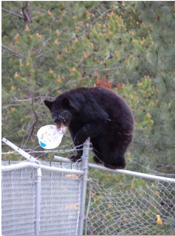
Figure 7. A black bear at the Glen Lake waste transfer site

The Lincoln County Glen Lake site had a black bear figure out how to get in without being shocked by the electrified fence (Figure 7). We will continue to work cooperatively with Lincoln County in 2021 to ensure that all waste transfer sites fences are in good repair and have functioning electrified fences to prevent future bears from accessing the sites.