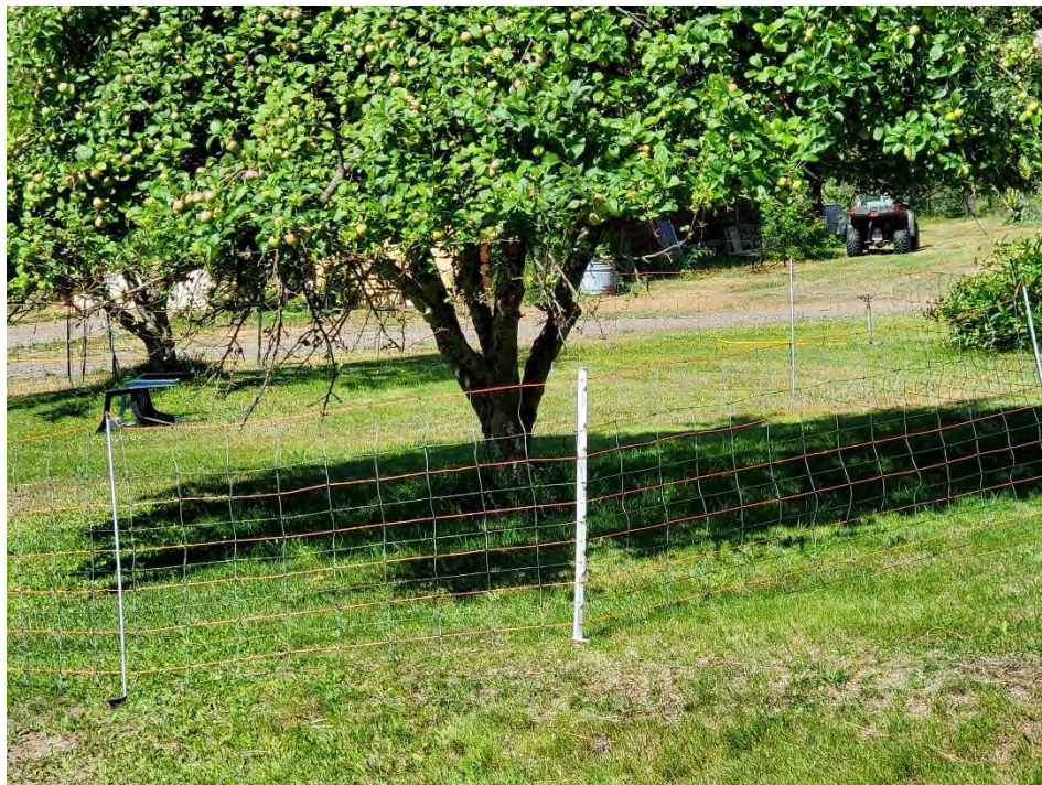
Figure 3. Portable temporary electrified net fence

Defenders of Wildlife, Yellowstone to Yukon Conservation Initiative, Montana Outdoor Legacy Foundation, and the USFWS have all donated electrified fencing materials and IGBC certified bear-resistant containers for residential use in the area. Portable electrified fencing materials are used to temporarily secure attractants during a conflict, or are loaned out to residents to secure attractants prior to a conflict (Figure 3). We also loan out bear-resistant containers to residents that do not have a secure location to contain their garbage containers, cannot afford to purchase their own bear-resistant container, or want to try a container prior to purchase. However, residents of both Lincoln and Sanders Counties can now purchase IGBC certified bear-resistant garbage containers through several local businesses.