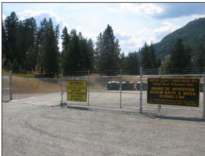
Figure 6. Lincoln County waste transfer site at the Fisher River confluence

Coordination continues with Lincoln and Sanders Counties to secure the public waste transfer sites and make them bear-resistant. Our primary role is to help the counties identify funding for materials to secure sites, and to help design effective and affordable bear-resistant fences. Since 2007, a combination of chain link fence and electrified wires have been installed to secure the following county waste transfer sites: Yaak, Fourth-of-July Creek, Yaak Hill, Troy Mine Road, Savage Lake, Highway 2 South, Trego, Pinkham Creek, Glen Lake, and Fortine. In 2020 Lincoln County completed securing the site at West Kootenai, leaving only Rexford, McGinnis Meadows and Happy’s Inn unsecured at this time. The Lincoln County landfill manager designed drive-over electrified mats as an alternative to traditional swing gates (Figure 6). Eliminating gates at these rural sites allows them to be electrified and in operation 24 hours per day, instead of 12 hours per day at the gated sites.