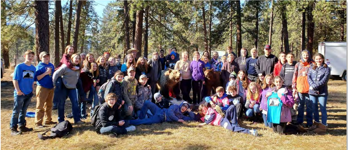
Figure 2. Sanders County 6 th graders outdoor bear education program