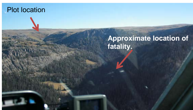
Figure 1. Aerial view of upper Cub Creek, the location of the fatality site, and the general location of the vegetation plot that was Mr. Stewart's objective.

The Cub Creek trail goes through timber and eventually enters high elevation grizzly bear habitat (Figures 1 and 2). The route that Mr. Stewart apparently chose to travel to