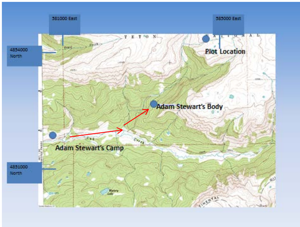
Figure 2. Overview map of Cub Creek, the camp and fatality sites, and the location of the vegetation plot Mr. Stewart was to visit. Red arrows note assumed direction of travel from the camp to the fatality site. See Figure 6 for an aerial view of this area.