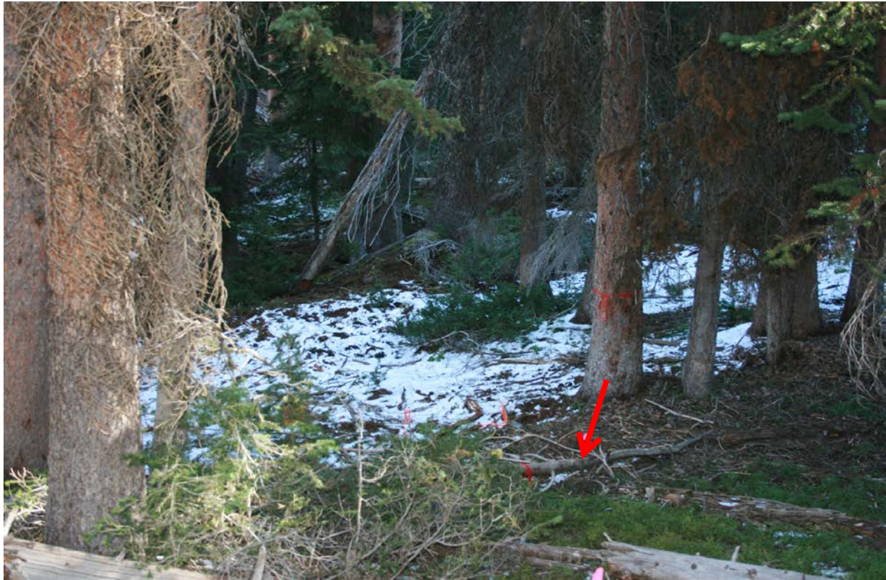
Figure 4. The view along the game trail in the assumed direction of travel by Mr. Stewart. The presumed attack site is in the foreground as noted by the flag where Mr. Stewart's hat and sunglasses were found. Red arrow points to human blood on a log. It is believed Mr. Stewart's body was dragged over this log toward the cache site. Cache site shown in Figure 3 is immediately behind trees on the left. Note limited sight distance in this area.

the vegetation plot he was assigned to survey took him through timbered habitat on a game trail and it was along this trail that Mr. Stewart's remains were found (Figures 3 and 4). The fatality site where Mr. Stewart's remains were found had limited visual sight distance because of relatively thick vegetation and undulating topography. From the direction we assume Mr. Stewart was travelling, the trail approaches the fatality site over a slight rise so that a person approaching the site could not see ahead until they came over this rise.