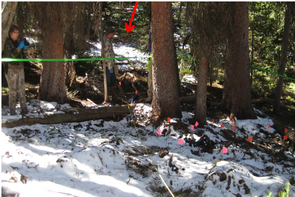
Figure 3. Cache in the foreground where Mr. Stewart's remains were found mixed in with the remains of a mule deer. Flags indicate remains. The assumed direction of travel into the site by Mr. Stewart is noted by the red arrow. Red arrow stops at the apparent site of the attack as noted by the presence of Mr. Stewart's hat and sunglasses and noted by red flags at that location.