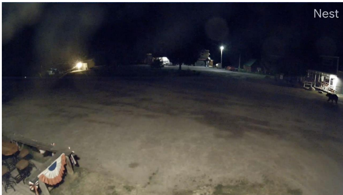
Figure 4. Still shot from video taken by security camera at the Blackfoot Angler's. Image shows a grizzly bear walking in front of the Museum on July 6, 2021 at 3:26 am.

Security camera video from the Blackfoot Angler, a store southeast across Main St. from the museum (Figure 1), showed an approximately 400 lb. grizzly bear (as estimated from the video), in the area approximately 35 minutes prior to the attack (Figure 4). Between 3:26 and 3:30 am a dark-colored bear was videoed coming from the southwest and walking around the front of the Museum. The bear spent about a minute investigating the grass area in front of the museum and then turned and retraced its path back around the museum heading southeast toward the post office. MFWP Game Warden Joe Kambic secured a copy of the video from Blackfoot Angler for review. This was the first bear captured on this video camera in 2021.