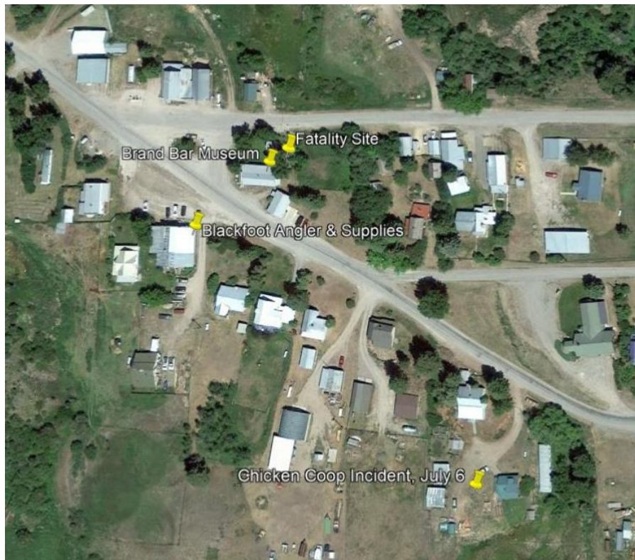
Figure 1. Map of Ovando, Montana with locations of Brand Bar Museum, the fatality site behind the museum, Blackfoot Angler where the security video of the bear was taken, and the chicken coop incident on July 6 th .

officer in charge of the investigation. Others responding to the scene included: Powell County Sheriff, MFWP Game Wardens, and MFWP Bear Management Team members. Additional notifications went out during the early hours on July 6 th to MFWP supervisors, U.S. Fish and Wildlife Service (USFWS), and the Blackfoot Challenge, a nonprofit organization in the Blackfoot Watershed, whose mission is to coordinate efforts to conserve and enhance natural resources and the rural way of life in the Blackfoot watershed for present and future generations.