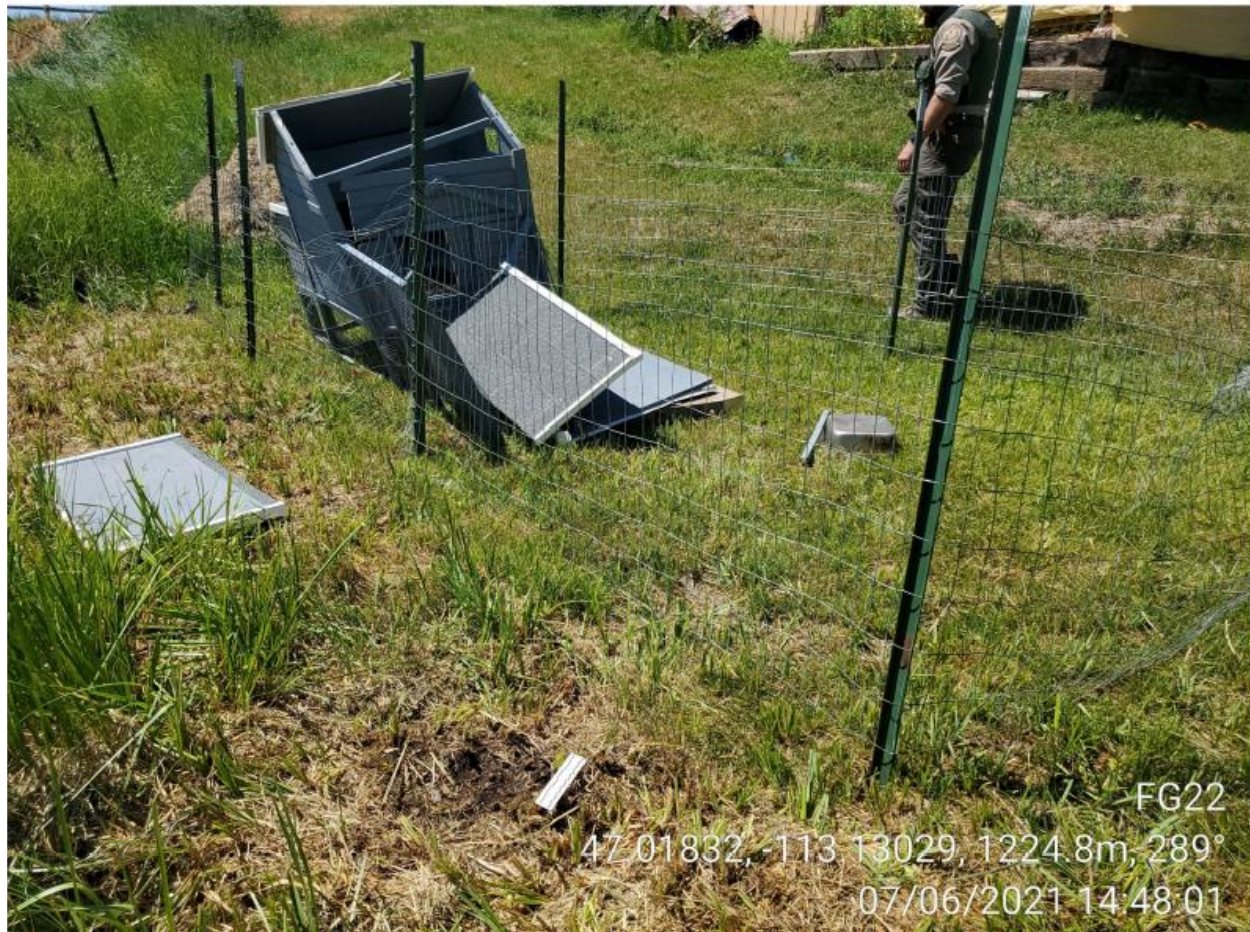
Figure 5. Chicken coop that was destroyed by a grizzly bear in the early hours of July 6 th approximately 215 yards from the attack site.

around the time Warden Kambic first arrived. Traps were set adjacent to the chicken coop area, the site was closed to the public, and remote cameras were set at the site.