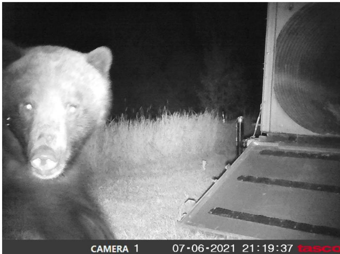
Figure 7. Remote camera image at trap site near the chicken coop approximately 215 yards from the attack site that was destroyed in the early morning hours of July 6 th . The remote cameras showed that a lone grizzly bear returned to the chicken coop site on July 6 th just after dusk but did not enter the trap.

No bears were trapped overnight, although it was discovered that a lone grizzly bear did return to the chicken coops the night before (July 6 th ) just after night fall at 12:01 p.m. (Figure 7). This was confirmed through remote camera images at one trap site near the chicken coops. The bear entered from the south side of town, along the riparian area near the old Ovando fish hatchery, to the chicken coop trap site. The bear did not kill chickens on this return visit, likely because the MFWP had constructed electric fences around the coop around the first attempted raid on July 6. The bear spent approximately 15 minutes on the south end of town and investigated one trap site. The bear appeared to have followed the “scent trail” and inspected the trap but did not enter the trap. There were no further observations of the bear in town, and it is assumed that the bear left the Ovando area that night and did not return.