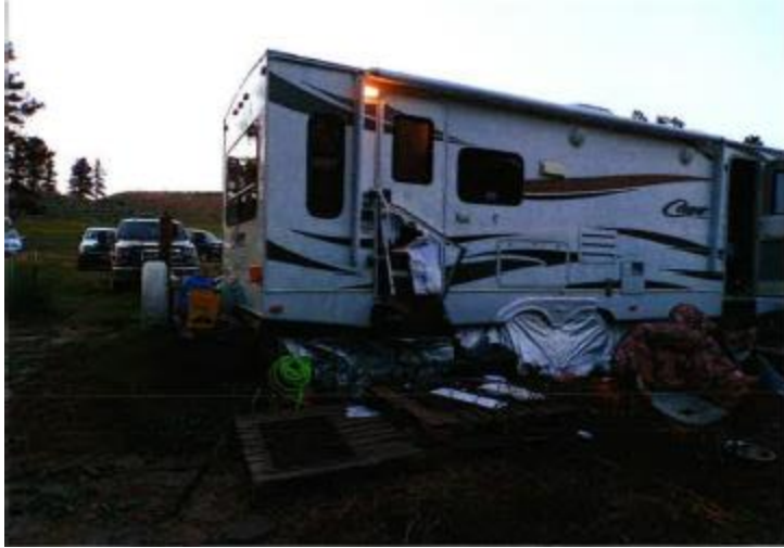
Figure 8. Trailer with the door partly ripped off by a grizzly bear approximately 3.9 miles west of Ovando. The incident likely occurred the evening of July 5 th .