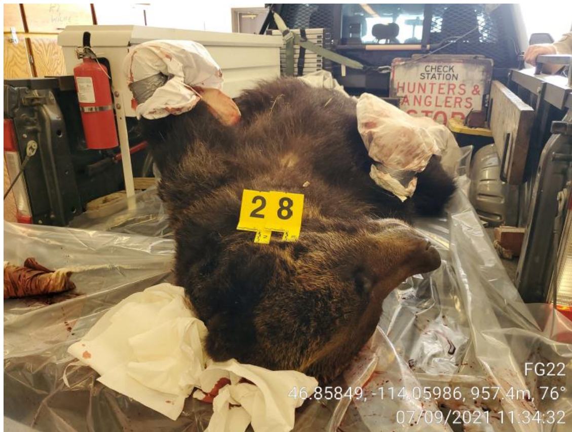
Figure 9. Young, adult male grizzly bear that was dispatched by WS shortly after midnight on July 9 th as it returned to the scene of a chicken coop that had been destroyed the day before. DNA confirmed that this was the same bear responsible for the attack on Ms. Lokan and destroying the chicken coop approximately 215 yards from the attack site on July 6, 2021.

Over the weekend the MFWP Bear Management Team continued a presence in Ovando and remained vigilant with evening and morning patrols. All traps, except one on the south side of town where the bear had been observed, were removed. MFWP decided, with community support, to retain one trap at the site until DNA results determined whether the correct bear had been removed.