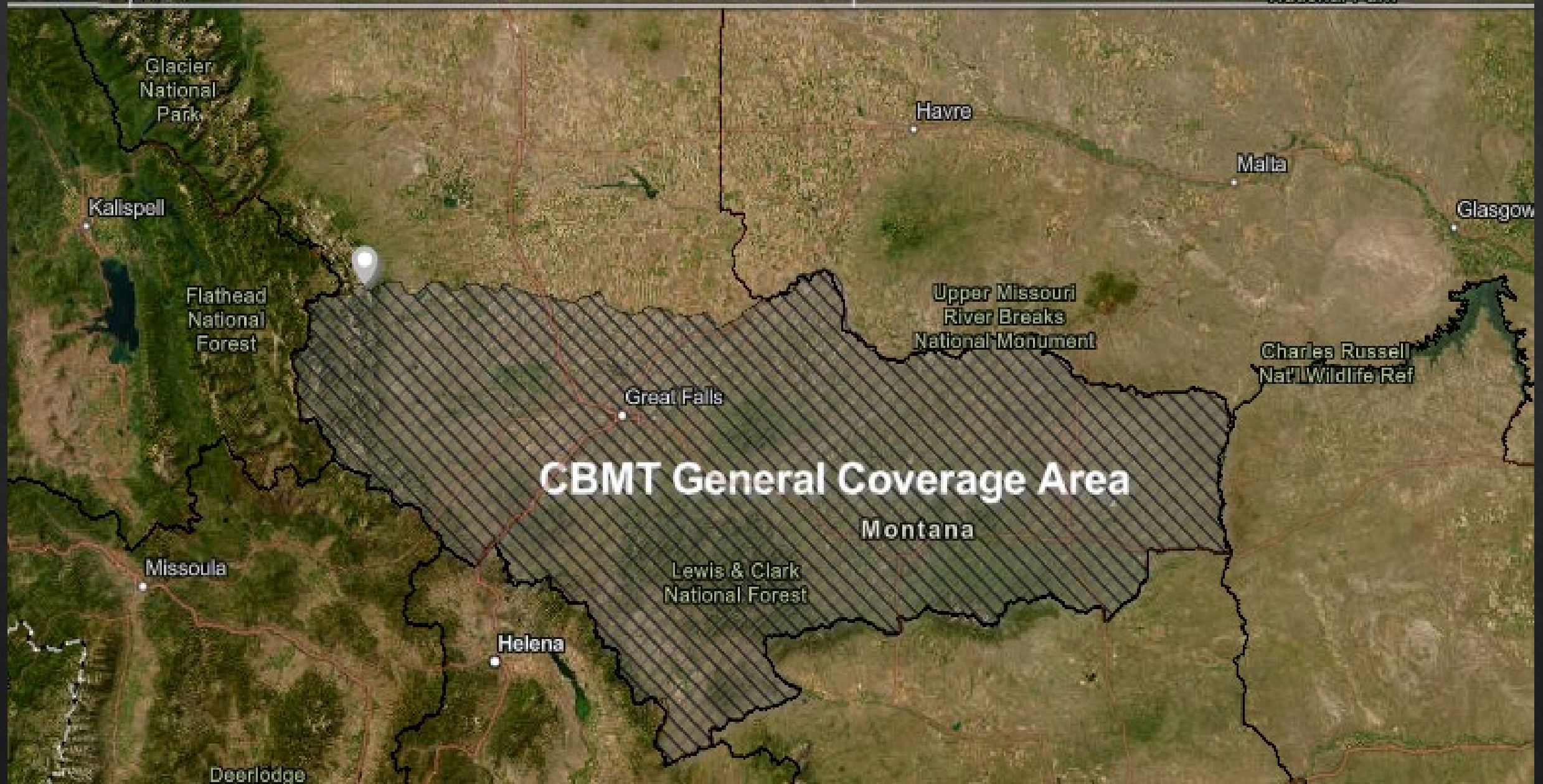
Figure 1. MFWP Region 4 and the portion of the region Choteau Bear Management Team is generally responsible for. responsible for.