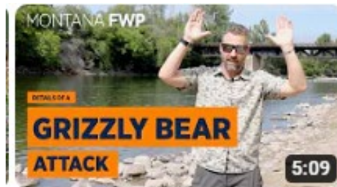
Riverbank Bear Attack: How to stay vigilant in bear...