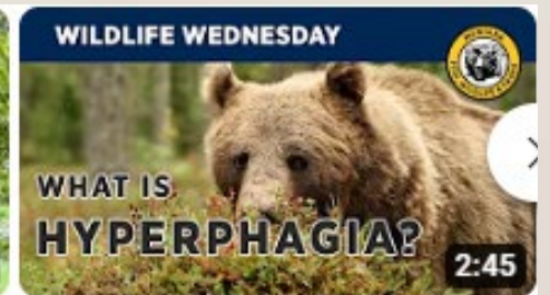
Wildlife Wednesday | Hyperphagia