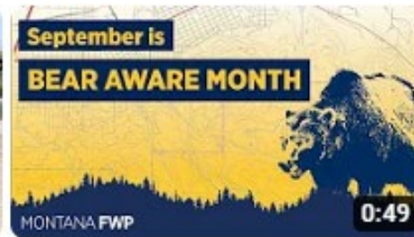
Bear Aware Month is Here MontanaFWP