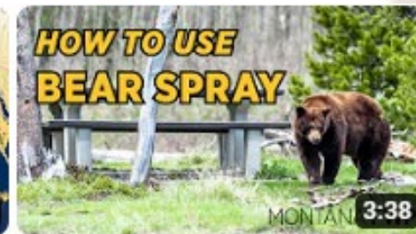
How to use bear spray | Montana Fish, Wildlife &...