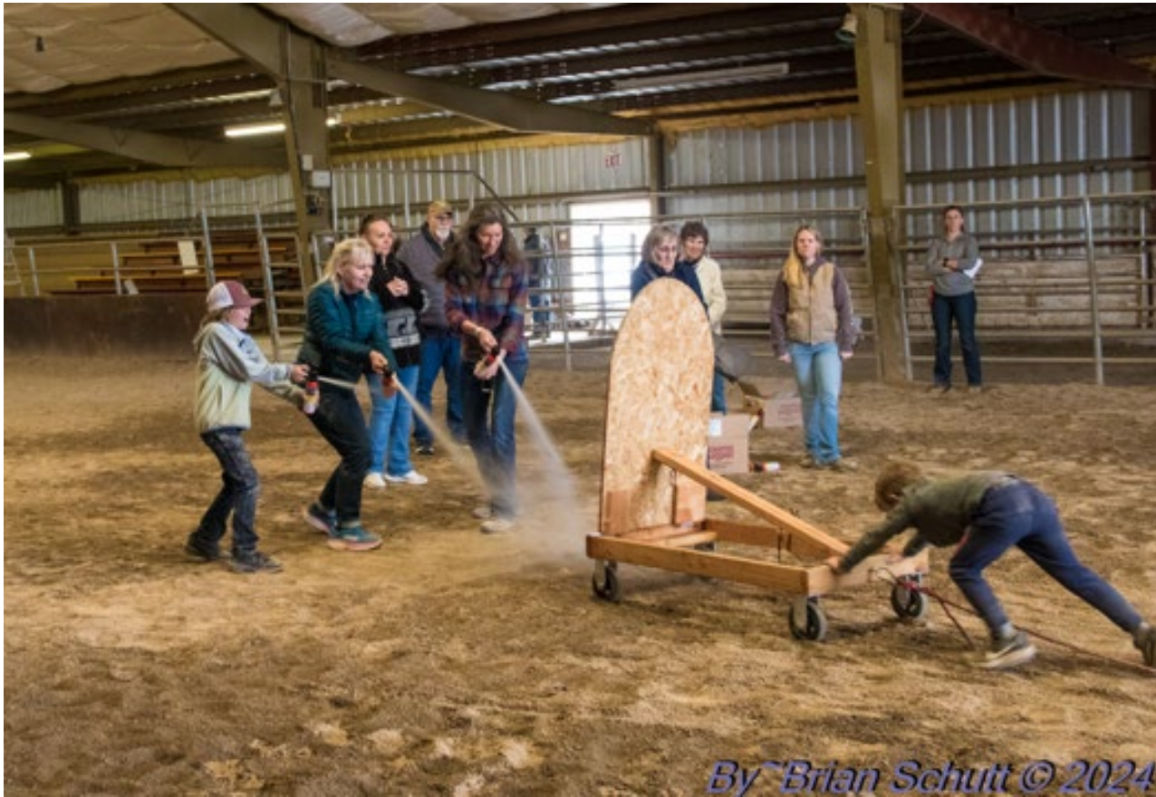
By ~Brian Schutt © 2024