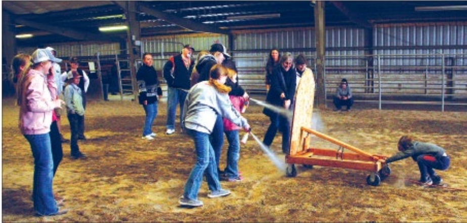
Acantha